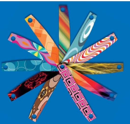
Tuttotondo Decorating Heat