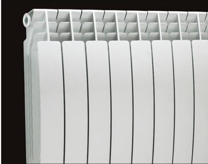
[Outputs: 90/70/20 Δt 60°C EN442]